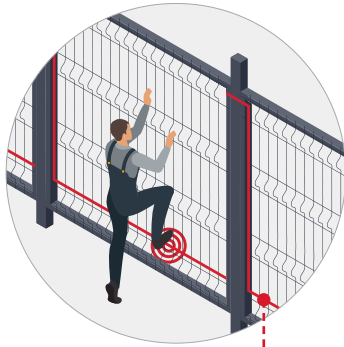
Fence mounted PIDS detect disturbances in & around perimeter fences

By combining detection strategies, FFT delivers a seamless & impenetrable defence system for airport facilities and infrastructure. From perimeter to server room, every layer of protection is designed to reduce risk, prevent downtime, & ensure compliance.