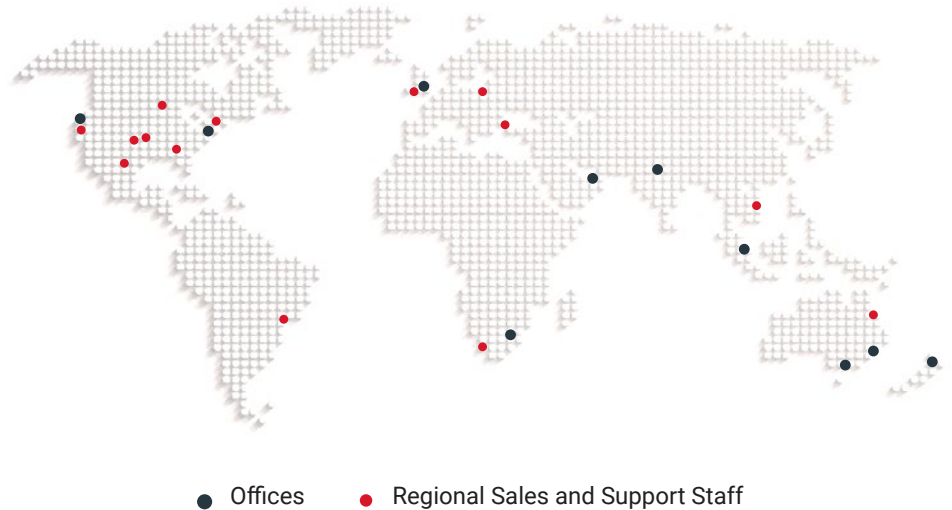
● Offices ● Regional Sales and Support Staff

With our highly skilled team spread across six continents we are never far away from our clients. We also run regular training courses in our Ava Group offices and other convenient locations around the world.